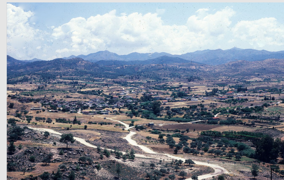
The Troodos Mountains of Cyprus rise to an elevation of 1952 m at Mt. Olympus, the center of the Troodos Ophiolite

Cyprus is served by airlines from most European countries, which mostly fly into Larnaca Airport. Public transportation is somewhat limited so arrangements will be made to meet participants upon arrival.